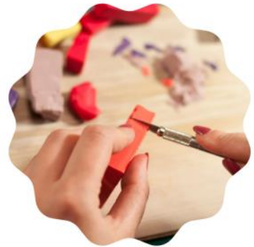
ADULT ART WORKSHOPS