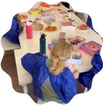
AFTER SCHOOL ART CLUB