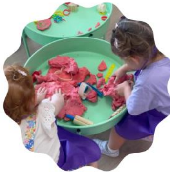
MINI MAKERS TODDLER SESSIONS