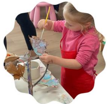
SCHOOL HOLIDAY WORKSHOPS