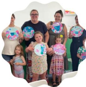
PRIVATE GROUP EVENTS