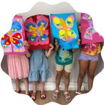
BIRTHDAY ART PARTIES